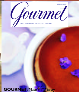
GOURMET / Maurk McEvoy