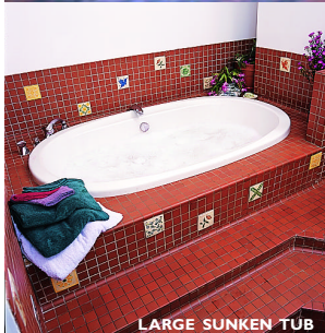
LARGE SUNKEN TUB