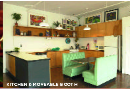
KITCHEN & MOVEABLE BOOTH