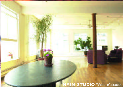
MAIN STUDIO / Where's abouts